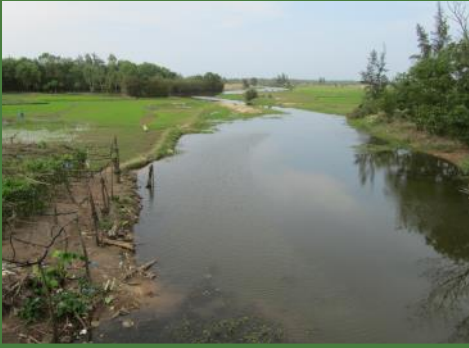
Left & Above Left: North of the Cua Viet River where Rusty Cascio's MedEvac picked up 8 WIAs

tourist area around the pagoda. Prepare for post tours, some for late evening flights home. (Meals: B/L)